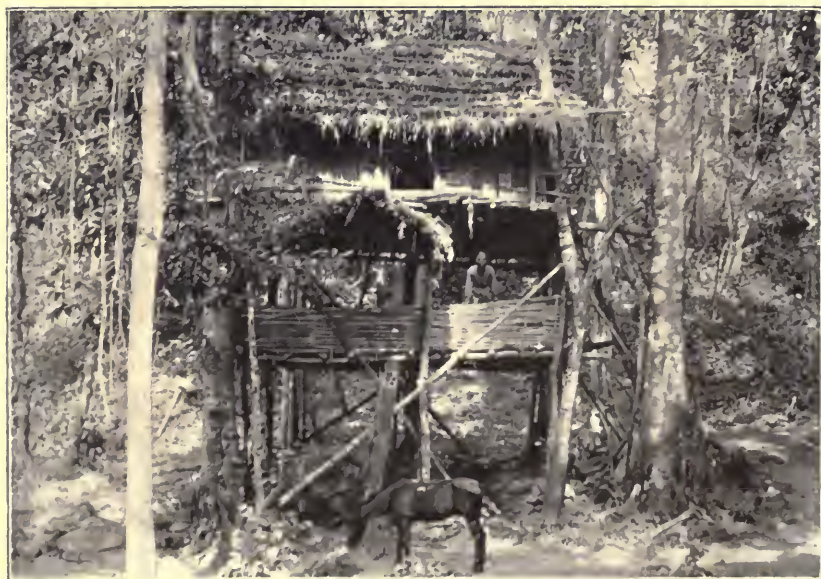
FOREST LODGE THE SECOND.